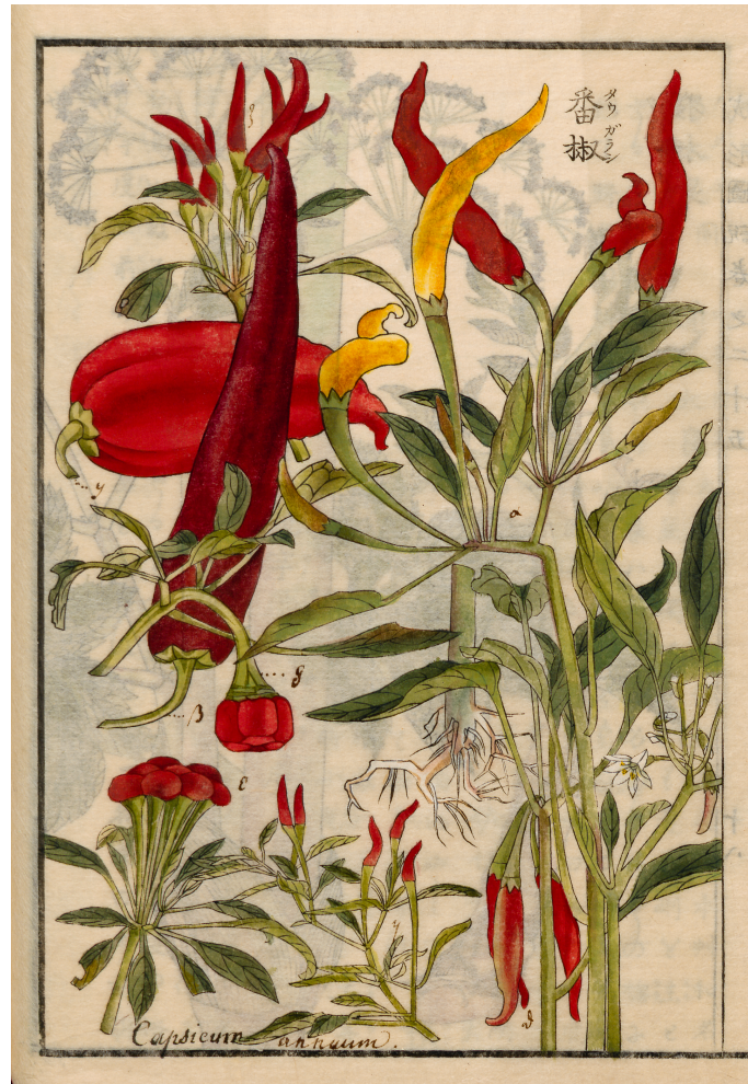
Illustration from the agricultural encyclopedia Seikei Zusetsu , scan from Leiden University Libraries . Date: April 14, 2026

Essential to this program is a robust theory of multiplicative equivariant Thom spectra, which we develop using parametrized higher algebra and fibrous patterns – particularly we provide an equivariant version of Antolín–Camarena–Barthel’s universal property for multiplicative Thom spectra and use this to deduce a multiplicative equivariant Thom isomorphism. We provide a number of categorical results of independent interest, most notably a distributive monoidal structure on parametrized left module categories.